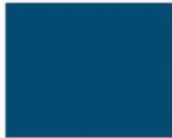
#24 Cadet Blue