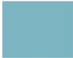
#63 Biscayne Blue