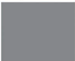
#60 Strata Gray