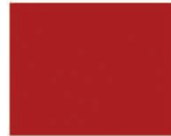
#55 Winchester Red